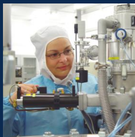
Research at BIOTEC center