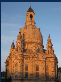
Church of Our Lady